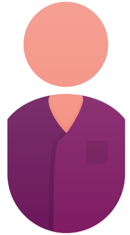
Imaging and radiotherapy healthcare professionals

1 Embed and enable research at all levels of radiography practice and education