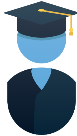
Students / Education