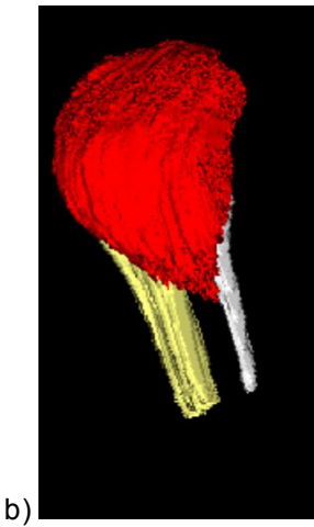
Figure 2 showing a) loaded gluteus maximus (red) and b) unloaded gluteus maximus (hamstring in yellow and bone in white in both images)