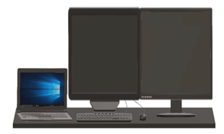
Figure 1. A diagrammatical representation of the workstation setup.

Participants were self-selected from conference delegates. Any radiographers trained in reading and interpreting mammography images and currently practicing in the UK were eligible for the study and booked a designated session to complete the test set.